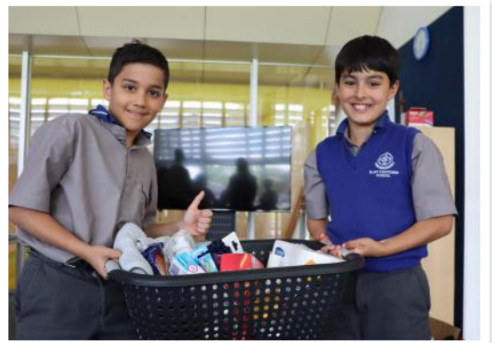
Saint Kentigern students putting emergency packs together for Shine refuges.

PSN, and Shine particularly, would like to say a heartfelt thank you to the students, staff and parents of Saint Kentigern for making this meaningful initiative possible. To the students who gave up their lunchtimes, the parents who helped out, and the incredible staff at Saint Kentigern who made this all happen; your generosity will bring comfort and dignity to families in need, and for this, we thank you.